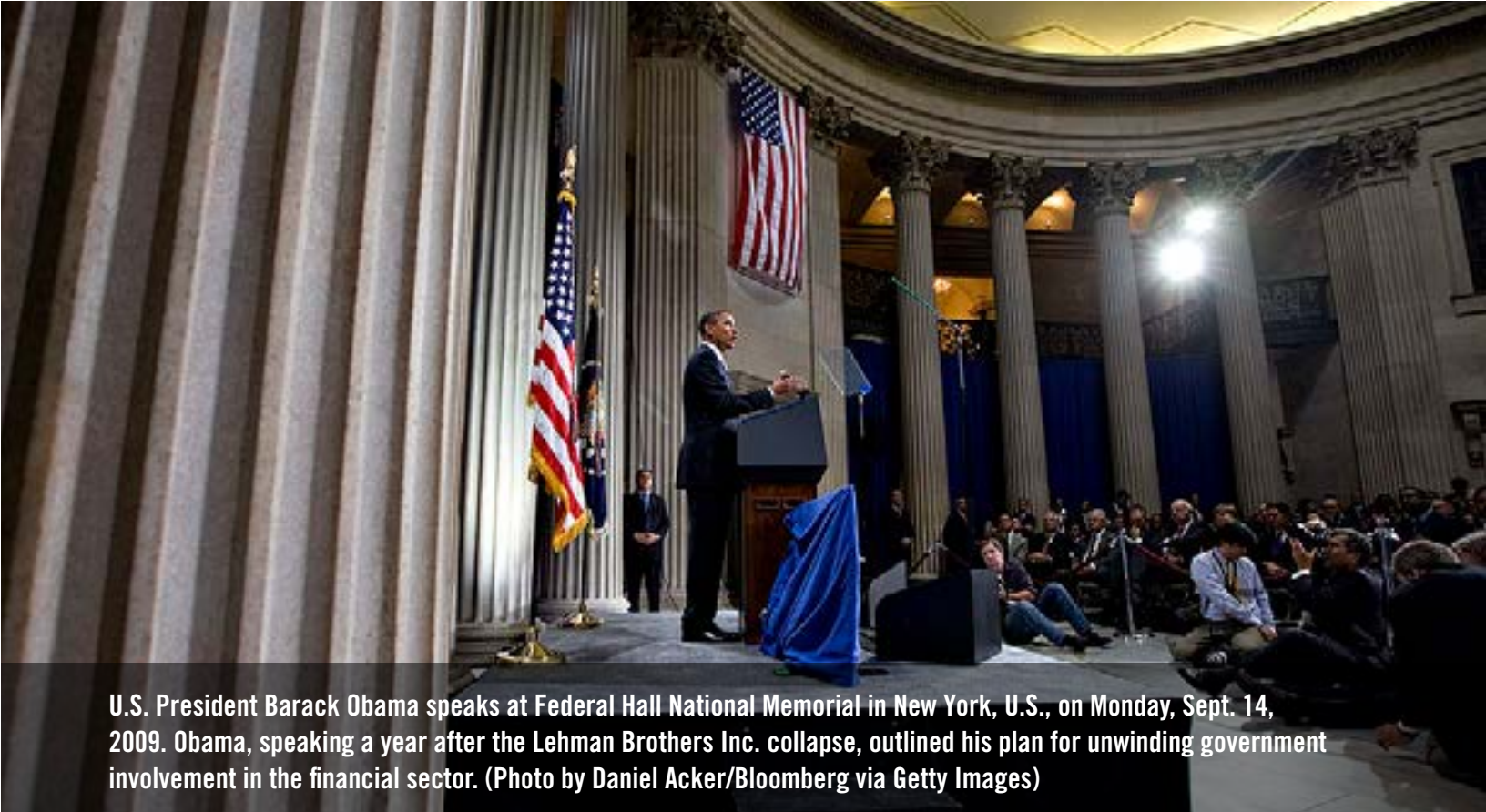
U.S. President Barack Obama speaks at Federal Hall National Memorial in New York, U.S., on Monday, Sept. 14, 2009. Obama, speaking a year after the Lehman Brothers Inc. collapse, outlined his plan for unwinding government involvement in the financial sector.

He wanted to speak directly to those leading the charge against reform and make the stakes clear. The President said, 12