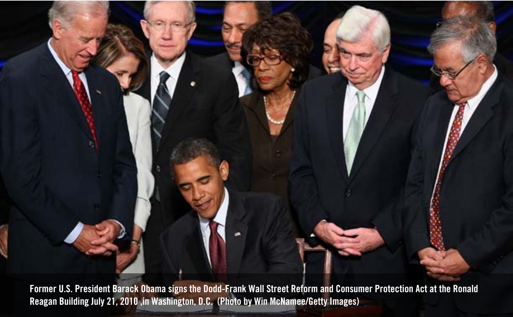
Former U.S. President Barack Obama signs the Dodd-Frank Wall Street Reform and Consumer Protection Act at the Ronald Reagan Building July 21, 2010, in Washington, D.C.

The President also remarked, again, that, “Our goal is not to punish the banks, but to protect the larger economy and the American people from the kind of upheavals that we’ve seen in the past few years.” Most importantly, he reiterated that, “Because of financial reform, the American people will never again be asked to foot the bill for Wall Street’s mistakes. There will be no more taxpayer-funded bailouts—period.”